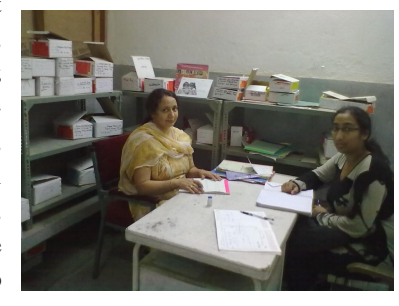
An MSW Intern at CHC-Shahpur

placed are: Government Zonal Hospital, Dharamshala; National Institute of Public Corporation & Child Development (NIPCCD) Delhi; DRDA, Shimla & Dharamahala; Vardhman Group of Companies, Ludhiana; NHPC, Chamba, H.P.; National Rural Health Mission (NRHM), Shimla; Centre for Sustainable Development, Mandi; Garib Nawaz Society, New Delhi.